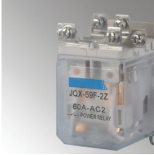
JQX-59F 2Z 60A